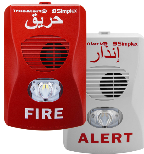
Figure 1: TrueAlert ES 59AV LED Addressable A/Vs are Available in Red with White Lettering and White with Red Lettering